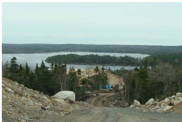
The New Bayside Camp

Gene has some more comments un-related to cats, rum and diarrhea. We, some of the AWA volunteers, went out to the Bayside Camp on Saturday to help build a bunk bed prototype. The following are Gene's observations. The photos show the work in progress.