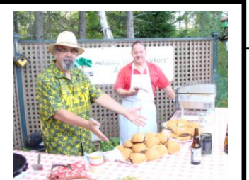
Figure 1 They are ready, so come.