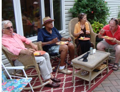
Figure 1 Put a caption on this picture.