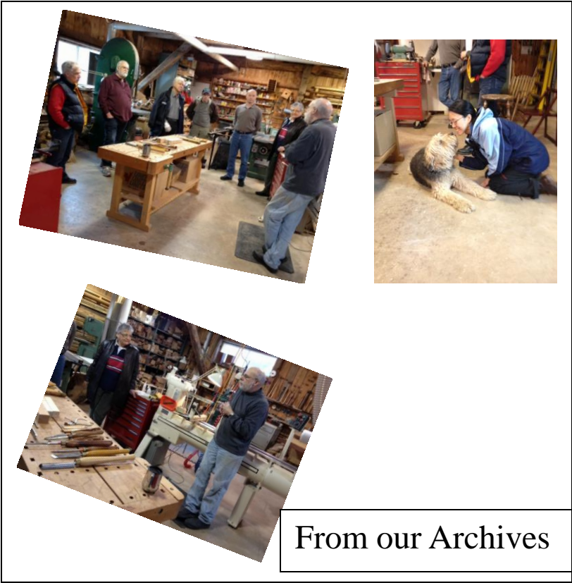
From our Archives

Mini Challenge for January 2016 Your choice, make something of mixed medium. This does not mean woods of different type. You need to add metal, glass, stone, plastic to name a few. This should inspire your imagination.