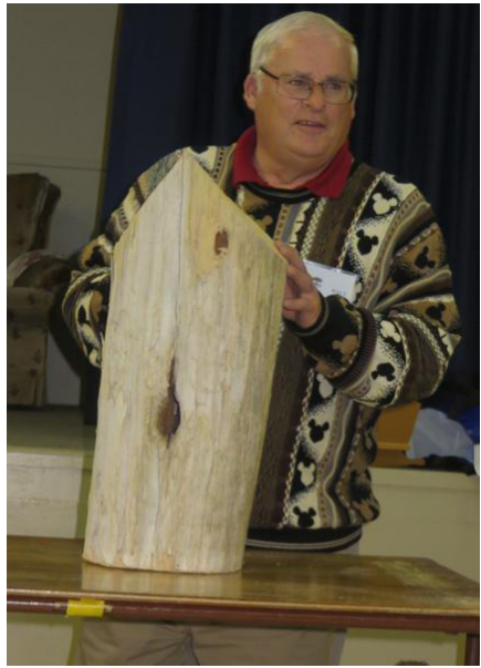
Rt. Walt he part of a hollow tree trunk which he planes to make a bird house. It is cut already for the roof and it has it's own natural hole for the birds.