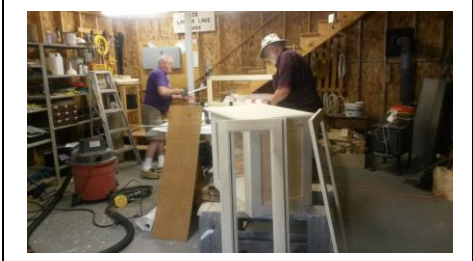
Figure 4 Working on doors, foreground shows units which are done.