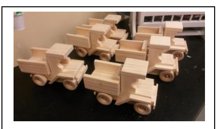
Figure 5 TOYS! TOYS! TOYS! I hat to say this but Christmas is coming faster then we like.

PS: A couple of pictures to showing our progress of the day.