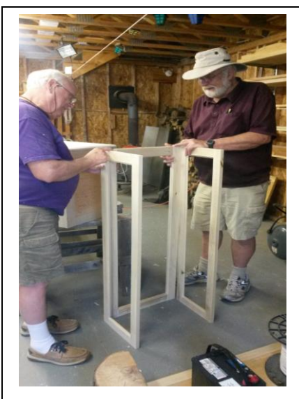
Figure 6 checking to see just how they go together. The panels will have glass sides and front with plywood in the back section.

With that in mind it isn't to early to get started on your toy project. These are toys given to the Salvation Army at our December meeting. Some children may only get the toy which we have made. It's a very worth while project.