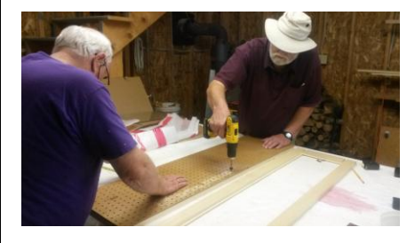
Figure 3drilling holes for shelf pegs, pegboard as our guide for spacing the holes