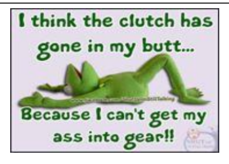
Figure 1sorry for the lateness of this newsletter