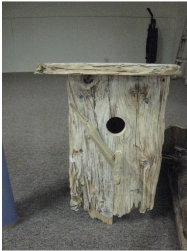
Figure 6 Stephen Parson, drift wood