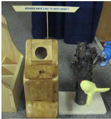
Figure 2, Walt Vandekieft