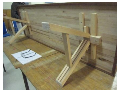
Figure 5, showing the leg assembly of the table