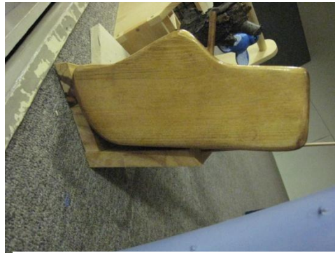
Figure 3. What kind of bird house would a Dutchman make?