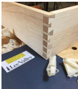
Figure 1 Brad Holley's houndstooth

(See more of the event on page 3 from Gary)