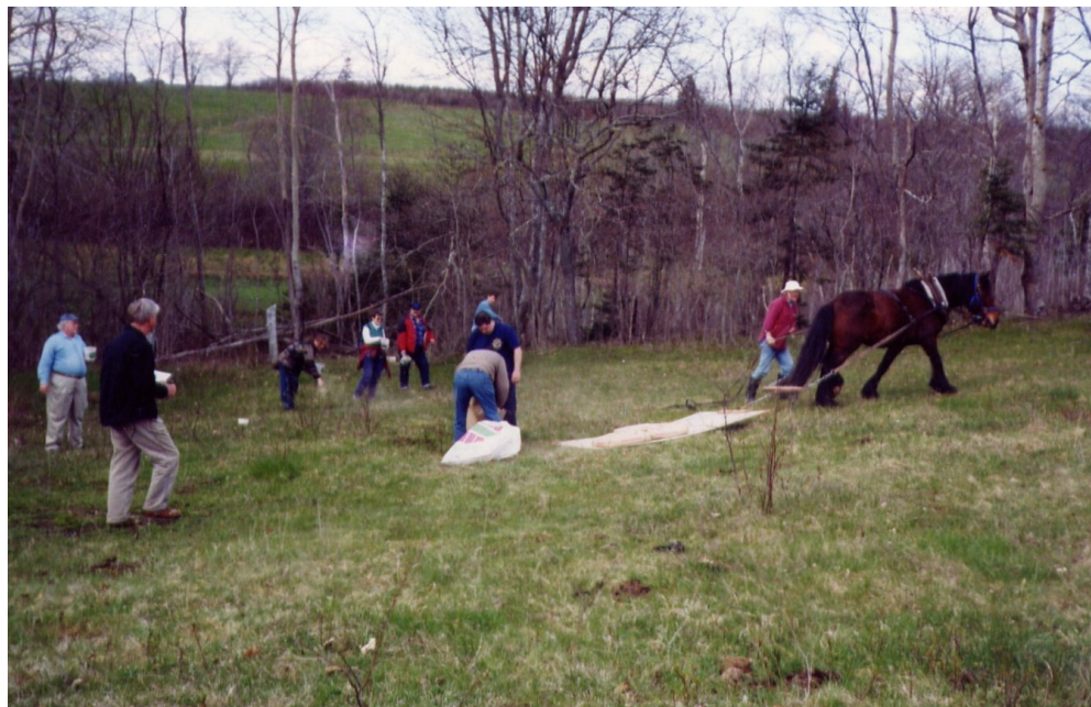
Illustration 3: Tried our lunc at a bit of farming with a little help from Ron's horse