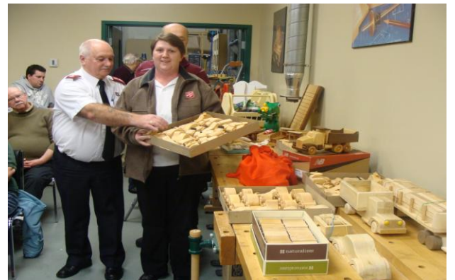
Figure 2 Salvation Army receiving the toys 2012