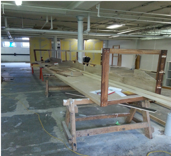
Illustration 1: 2 x 24ft units that will have a city scape on and will fly above the heads

I have been busy building sets for Don Giovanni, an Opera that is being performed on the 23 – 24 May. It is made from recycled wood and blue styrofoam. I am enclosing a couple of pictures of early construction.