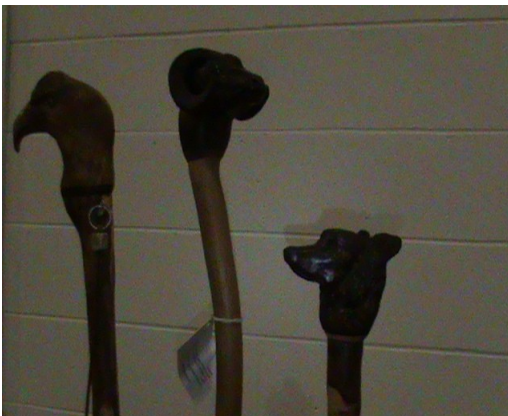
Illustration 2: Cane figure heads