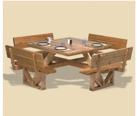
Illustration 1: Table as described by Phil Carter for Museum

Make this attractive and functional square picnic table from our full-size pattern. The table seats eight adults and can accommodate a standard umbrella. (Dimensions: Top 50" Square and 30" High, Seats 42" Long) Use Hardware Kit #YF16KIT