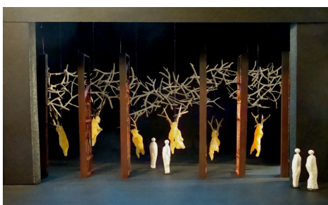
The stags as seen in this model of the set.

This is what I have been doing for a part of April and most of May, building sets for the opera Luisa Miller. It was performed in the Dunn theatre at Dal. The units are 20 feet high and constructed to open as seen on the picture on the right. Above you can see the rafters and peak to simulate a house. The mesh in the back ground are stag horns which our designer created. In a future act the carcuses of stags come down. Yes I now have my life back.