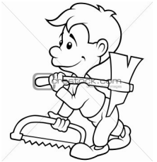
1 2: The Helper

These two pictures show our new cabinet for our library. The views show both the front and back view. For those who worked on it's construction and helped in getting it to our new home, the Salvation Army Church we send a big THANK YOU.