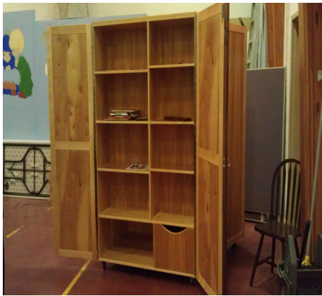
Cabinet 2: Front view - Photo by Stan Salsman

Mini Challenge for March is to construct a bench or stool or foot stool or table like bench out of wood of your choice. The item can be for your shop or for your main living quarters or as a gift. If possible please bring in the item on March 12, if not we will accept a picture and description from you in person.