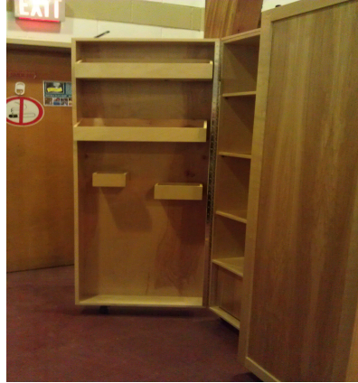
Cabinet 1: ack view

These two pictures show our new cabinet for our library. The views show both the front and back view. For those who worked on it's construction and helped in getting it to our new home, the Salvation Army Church we send a big THANK YOU.