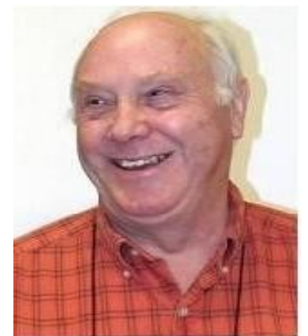
He's smiling because it's warm where he is

Parking is available on the side parking lot or at the front door.