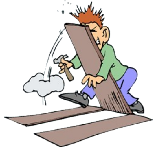
Oops 1: accidents can happen